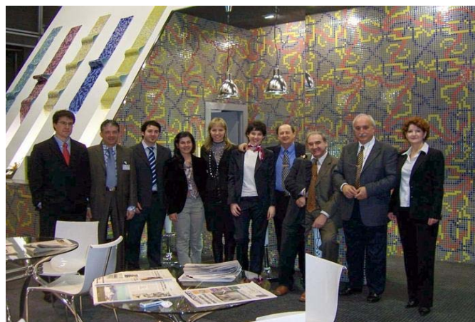
Reviglass' commercial team