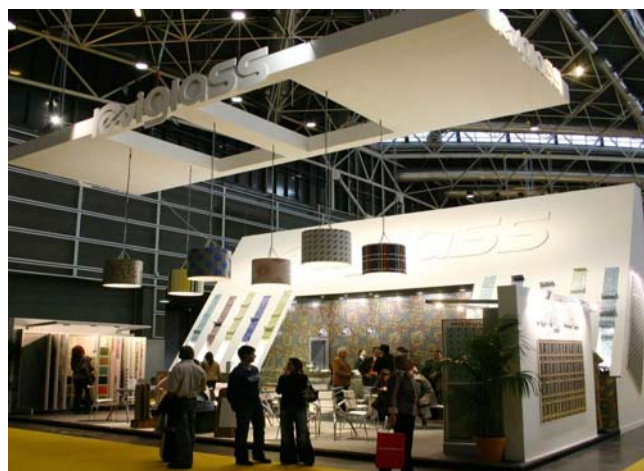
Our comercial team helping to the customers

As every year Reviglass was present in the spanish fair as one of the world glass mosaic manufacturing leaders.